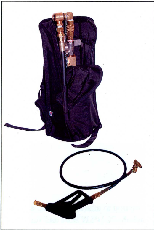
X-10SW — X-10 cylinder in backpack with sprayer connected to hose